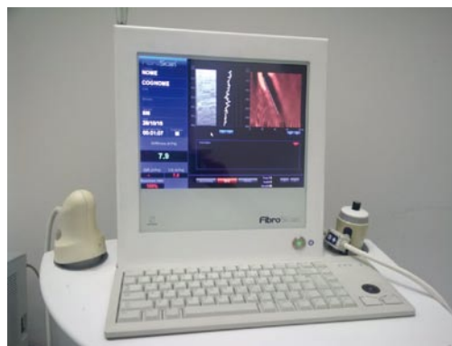
Figure 2 Transient elastography uses a low-frequency pulsed excitation to generate shear waves in the tissue, with the velocity of the shear wave - established to be related to tissue stiffness - to be measured with an ultrasound pulse-echo technique and used to calculate the elasticity.

Vibro-acoustography: Vibro-acoustography (VA) is a speckle-free US-based imaging modality that allows to visualize both normal and abnormal soft tissues, by mapping the acoustic response of the target tissue to a harmonic radiation force induced by US itself [2,14,19] . The method is based on the acoustic emission generated by focusing two US beams of slightly different frequencies at the same point and generating a vibration in the tissue, with a final frequency resulting from the difference between the frequencies of the primary US beams. The acoustic emission is normally detected by a hydrophone and the brightness of each image pixel is proportional to the amplitude of the acoustic signal.