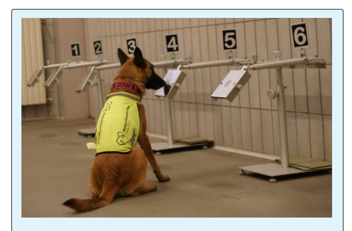
Figure 1: Bloom sitting in front of a positive sample. The six sample stations, of stainless steel, were positioned in a single straight line.

The six sample stations, designed and constructed of stainless steel, were positioned in a single straight line as in Figure 1. The training consisted of two sessions of six runs. In each run, samples tubes were selected to compose six-slot panels so that 1 sample of Group 1 and at least 1 sample of Group 2 were compared with samples of healthy subjects, possibly varying the identity of the donors. The positions of the samples were randomly changed throughout the successive trials; thus, the dog's choices could not be driven by any memory interference. Moreover, since each dog carried out two sessions per day, at the end of each session the six-slot panels were changed and the sample station perfectly cleaned with a vapor machine. Dogs were asked to indicate the correct responses by sitting directly in front of the station containing the cancer sample.