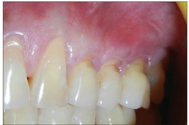
Figure 6: Postoperative photograph

graft with buccal flap advancement. Covering the PBFP with buccal flap was beneficial as it may secure it tightly and protect it against perforations and infections.