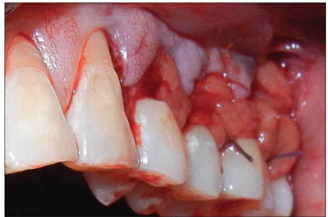
Figure 4: Buccal fat pad secured against root surface of recipient site