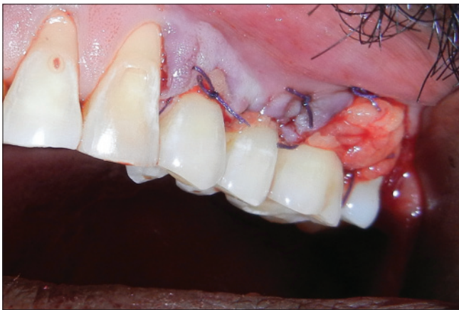
Figure 5: Buccal fat pad covered with flap and sutured