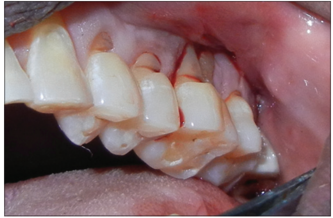
Figure 2: Horizontal incision placed in vestibule