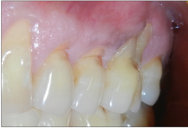
Figure 1: Preoperative photograph