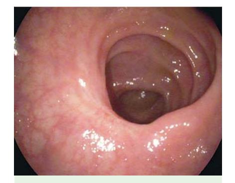
Fig. 5 Endoscopic view showing the scarred resection site 3 months after the full-thickness resection.

Here, we report the case of a 78-year-old man with a history of coronary artery disease and recent pulmonary embolism being treated with anticoagulant therapy who underwent colonoscopy for hematochezia. A 3-cm non-pedunculated colorectal polyp with with Kudo V pit pattern was observed 5 cm above the dentate line