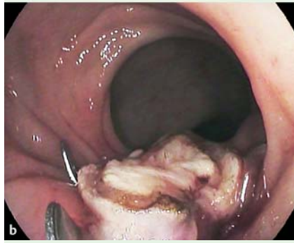
Fig. 2 Endoscopic views 3 months after the first endoscopic mucosal resection showing: a the scarred resection site (approximately 15 mm); b the immediate appearance after the full-thickness resection, with the over-the-scope-clip (OTSC) completely sealing the rectal wall defect.