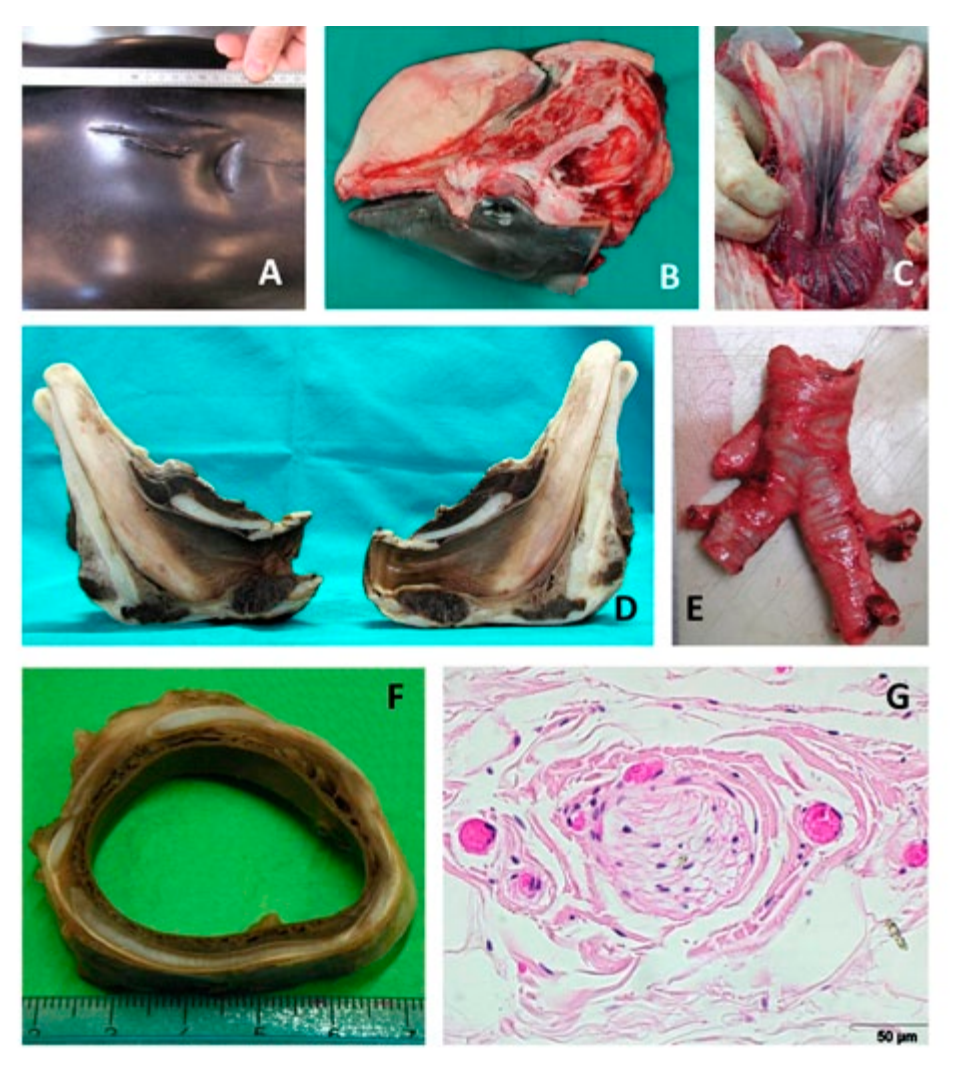
Figure 1 – Images of the upper respiratory tract of dolphins. A), Blowhole of a bottlenose dolphin; B) Section of the head of a Risso's dolphin showing the blowhole opening into the nasal sacs; C) Laryngeal tonsil of a bottlenose dolphin; D) Sagittal section through the trachea of a bottlenose dolphin; E) Trachea and early bronchial subdivisions of a Risso's dolphin; F) Thick section of the trachea of a bottlenose dolphin showing the huge vascular venous plexus in the submucosa; G) Innervation of the submucosal venous plexus of the trachea of a bottlenose dolphin.

The blowhole of the three species shows the classical crescent shape of the external lid that leads Fig. 1A), upon opening, into a series of chambers that in the living