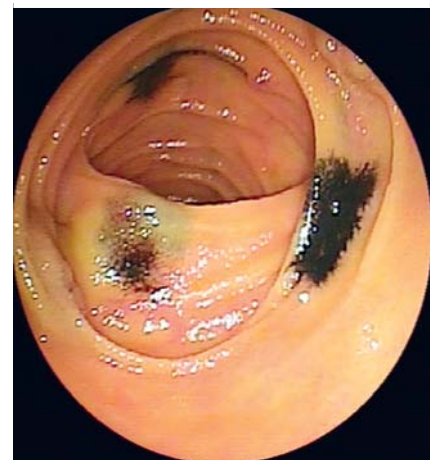
Fig. 3 Proximal and distal visible vascular malformations were marked with ink.