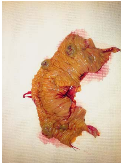
Fig. 5 Specimen from surgical segmental resection of the ileal tract following enteroscopy with endoscopic ligation of vascular lesions.