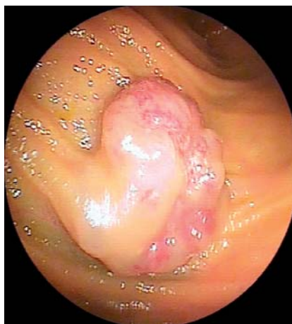
Fig. 2 Double-balloon enteroscopy showed vascular lesions with signs of recent bleeding.