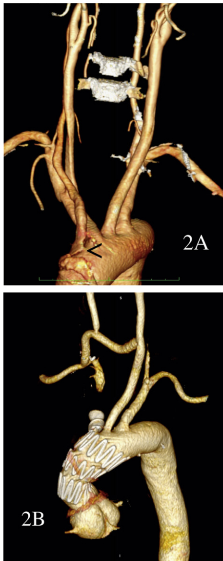
Figure 2. (A) Type A dissection after limited open repair extended to brachio-cephalic trunk and right common carotid artery: 3D VR reconstruction. (B) TEVAR in the ascending aorta + reversed LCC–RCC–RSA bypass. Plug into the brachio-cephalic trunk: 3D VR reconstruction.

we adopted a maximum oversizing of 10%. A complete TEE should be performed in all cases to assess cardiac and aortic valve function, in combination with an angiography to confirm the patency of the supra-aortic branches and coronary arteries.