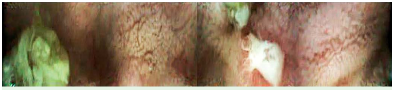
Fig. 4 Large and deep ulcer of the distal ileum (quadrant 3).