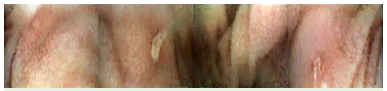
Fig. 1 Two superficial jejunal ulcers in the second and fourth quadrants.

mic 360° viewing with wire-free technology, longlasting battery life, and 12–20 frames per second captured by four highresolution cameras located on the capsule sides and facing the four quadrants of the digestive wall [4,5]. To the best of our knowledge, there is no published report on the use of this new technique in patients with suspected small-bowel Crohn's disease. Here, the case of a 51-year-old woman with a 2-year history of chronic, nonbloody diarrhea is presented. Physical examination was unremarkable and laboratory parameters were within the reference ranges, with the exception