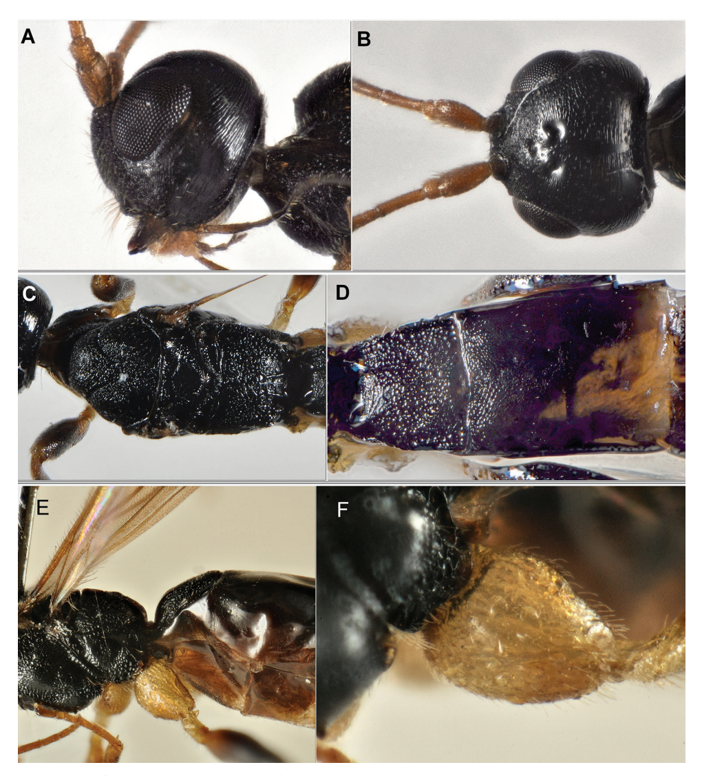
Figure 2. Rhoptrocentrus piceus Marshall: A head, lateral view B head, dorsal view C mesosoma, dorsal view D metasoma, first three segments, dorsal view E propodeum and base of metasoma, lateral view F hind coxa, lateral view.

in the Nearctic region (several states of the the USA). The genus Rhoptrocentrus was already referred to from Mexico (Coronado-Blanco 2013), but without species names; here we record R. piceus from Mexico for the first time: 1 female, "Mexico. Tamaulipas, Altamira, Ej. Aquiles Serdan, Trampa Malaise 3, 22°33'2.78"N, 97°54'13.11"O, 15–30 Marzo, 2013"; 1 female, "Monterrey, Nuevo Leon, 20-IV-86, E. Ruiz C." (both specimens from the collection of the Universidad Autónoma de Tamaulipas, Cd. Victoria, México).