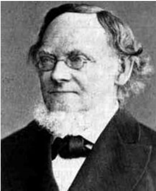
Hermann Grassmann (1809 - 1877)

Axioms for exterior algebra. Unrecognized by Möbius, Kummer. Dispute with Saint-Venant.