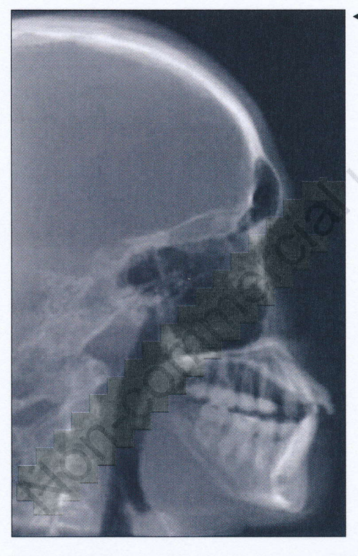
Figure 4 - Cone beam computed tomography image showing correction of the retrognathia at the end of orthodontic treatment.

border. The results showed that the mandible had moved forward and downward in relation to the anterior cranial base. In addition, bone apposition was observed on almost all of the surfaces of both mandibular condyles and the roof of the glenoid fossa. TMJ involvement is often asymptomatic in patients with JIA, and can lead to severe craniofacial growth disturbances and facial deformities if left untreated (10). However, early TMJ arthritis is difficult to diagnose in JIA patients because of the relatively few symptoms and clinical findings (11, 12) and the fact that none of the clinical signs or symptoms of TMJ dysfunction are predictors of bony destruction. Consequently, the pathological process can affect growth long before any radiographic changes can be seen, and early collaboration between dentists and rheumatologists is very impor-