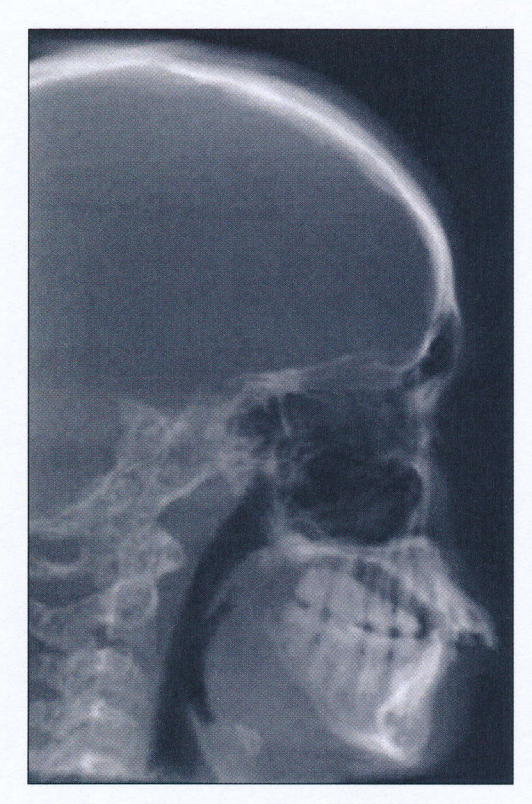
Figure 1 - Severe mandibular retrognathia and proalveolia of the upper arch.

and a high erythrocyte sedimentation rate (ESR).