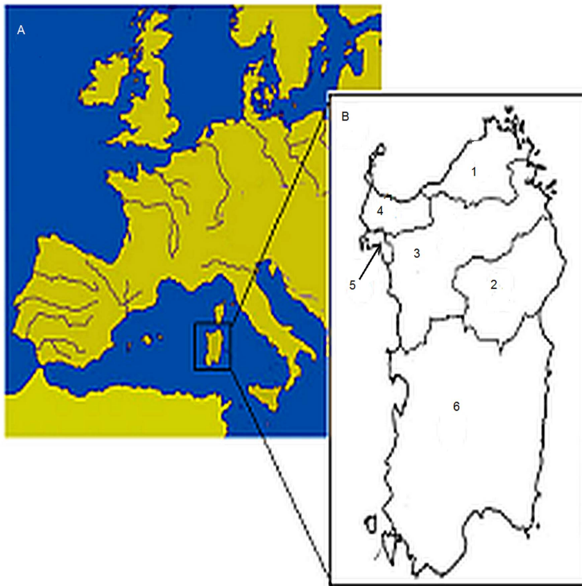
Figure 1. Map of Mediterranean basin showing the localization of Sardinia and Sardinian linguistic domains. A) Map of the Mediterranean basin showing the geographic position of Sardinia. B) The Sardinian linguistic domains: 1 = Gallurese (77 individuals); 2 = Nuorese (88); 3 = Logudorese (385); 4 = Sassarese (342); 5 = Alghero (87); 6 = Campidanese (98). doi:10.1371/journal.pone.0091237.g001

Figure 1: Gallurese (n = 77), Nuorese (n = 88), Logudorese (n = 385), Sassarese (n = 342), Alghero (n = 87) and Campidanese (n = 98). Part of the samples (n = 250) have been already analyzed in a previous work [11].