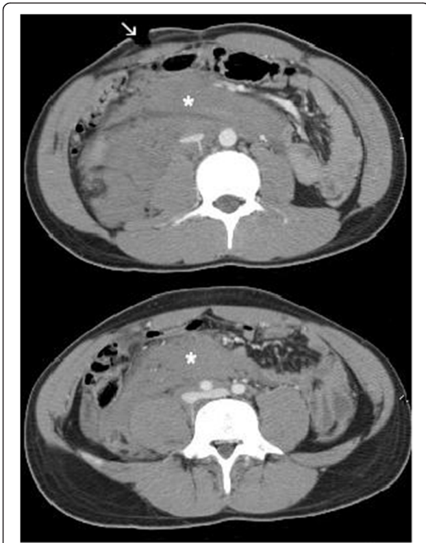
Figure 1 CT scan on admission. CT scan on admission showed a large retroperitoneal hematoma (*). Entrance site of penetrating wound is visible at right lower quadrant (arrow).

broad spectrum antibiotics (imipenem) and was discharged in 8 days.