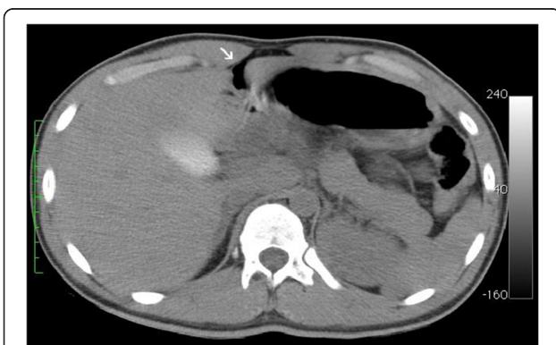
Figure 2 Repeated CT scan. A CT scan was repeated after the patient developed peritonitis. Peritoneal free air was detected (arrow).

Ten days later he was readmitted for fever and worsening lumbar pain radiating to the limbs bilaterally with minimal walking impairment. Blood exams revealed increased C-reactive protein (CRP) levels and leukocyte count. Abdominal CT scan showed no signs of intra or