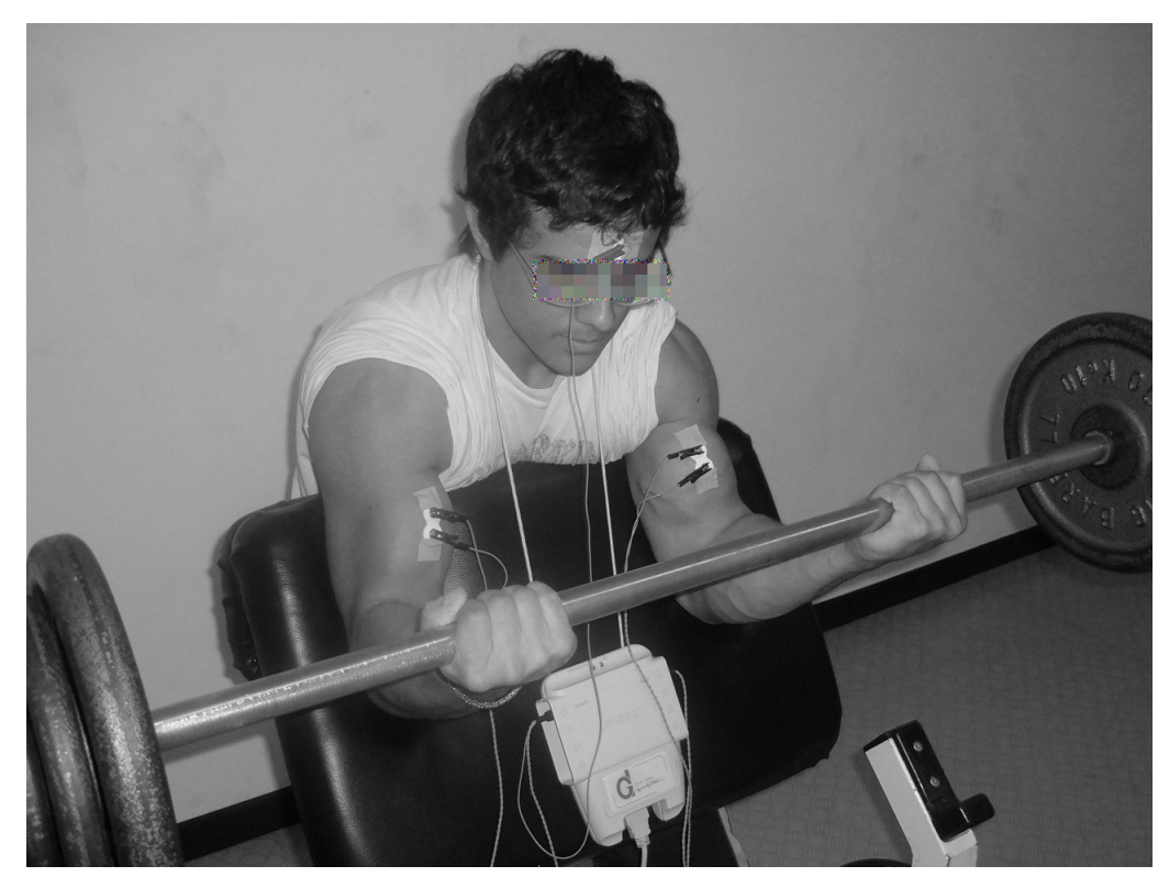
Fig. (1). Upper limbs arrangement and electrode positions during the isometric contraction.

because this set avoids or reduces the intervention of shoulder and trunk muscles. On both exercises the grip width on the barbell was close to shoulder width and the setting. An expert trainer controlled the correct position of the subjects during the performance of all exercises.