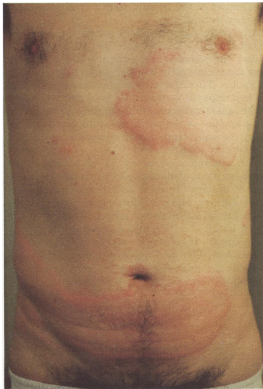
Figure 1 Urticarial eruption on the patient exposed to triphenyltin acetate.

value 60–110), \gamma -glutamyl transpeptidase ( \gamma -GT) 68 IU/l, and bilirubin 1.52 mg/100 ml (normal value 0.36). Other routine laboratory findings were normal. A glucose tolerance test on the fifth day showed impairment of glucose metabolism and slight glycosuria.