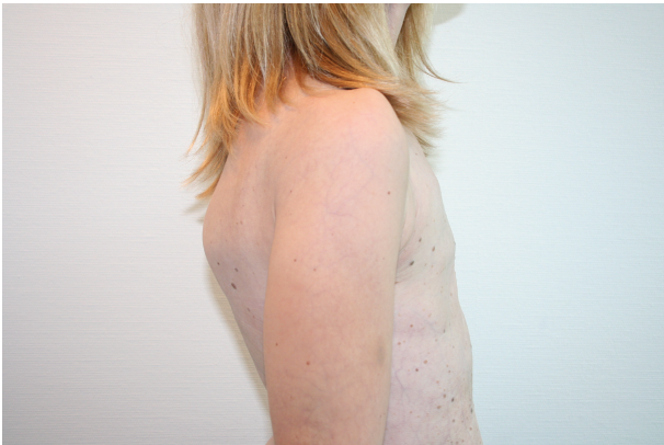
FIGURE 4: Preoperative lateral view, showing total absence of the mammary mound.