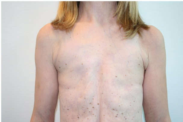
FIGURE 1: Preoperative frontal view, showing complete amastia with the presence of a hint of bilateral nipples.

An abnormal adipous tissue distribution with an increased deposition focused on superior arms and sacrolumbar region and hypotrophy of Bichat's fat pad ( Corpus adiposum buccae ) were also present. Patient's skin appeared thin with visible superficial vascular weave all over the body. The linea alba , a fibrous structure composed mostly of collagen connective tissue, was strictly adherent to the upper layers of the skin, without fat interposition.