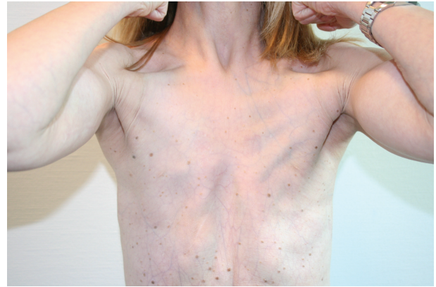
FIGURE 2: Preoperative view. Note thin skin with visible superficial vascular weave and hypofunction of pectoralis muscle.

At birth she also suffered from hypodeveloped auricles and lips and corneal ulcerations caused by bilateral absence of superior and inferior eyelids (see Figure 5). These alterations were treated with several reconstructive surgeries in her childhood. When she was one-month-old, two cutaneous biopsies showed hypotrophic cutaneous appendages, especially sweat glands. Karyotype analysis was normal. Clinical and histologic data allowed genetists and dermatologists to make a diagnosis of ectodermal dysplasia.