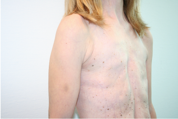
FIGURE 3: Preoperative oblique view.