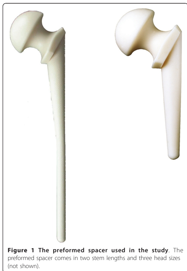
Figure 1 The preformed spacer used in the study. The preformed spacer comes in two stem lengths and three head sizes (not shown).

To prevent implant rotation, the spacer was fixed only in the proximal part with one pack of antibiotic-loaded cement (Cemex Genta, Tecres) containing gentamicin