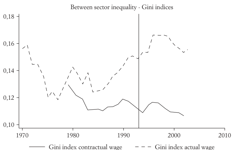
FIG. 3. Aggregate inequality measures.