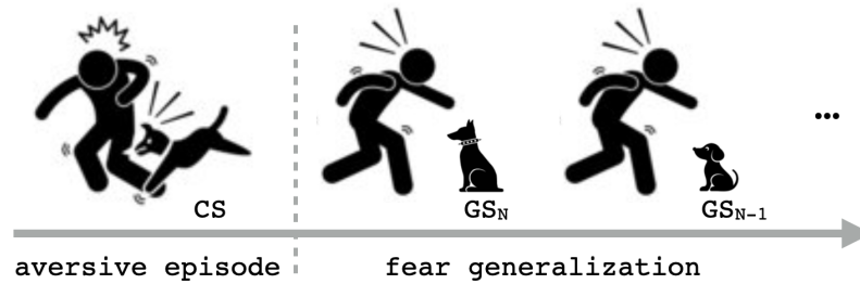
Fig. 1. Fear learning and generalisation. An aversive episode pairs the perceptual stimulus (conditioned stimulus CS) of a black dog with a painful bite (unconditioned stimulus, US). Learnt fear can subsequently spread over a gradient of harmless stimuli (generalisation stimuli, GSs) more or less similar to the original CS

knowledge from a learning episode [33]. Yet, excessive generalisation may become maladaptive and pathological. Crucially, the overgeneralisation of fear to harmless stimuli or contexts might even turn into a burden to daily life and characteristic of several anxiety disorders [12].