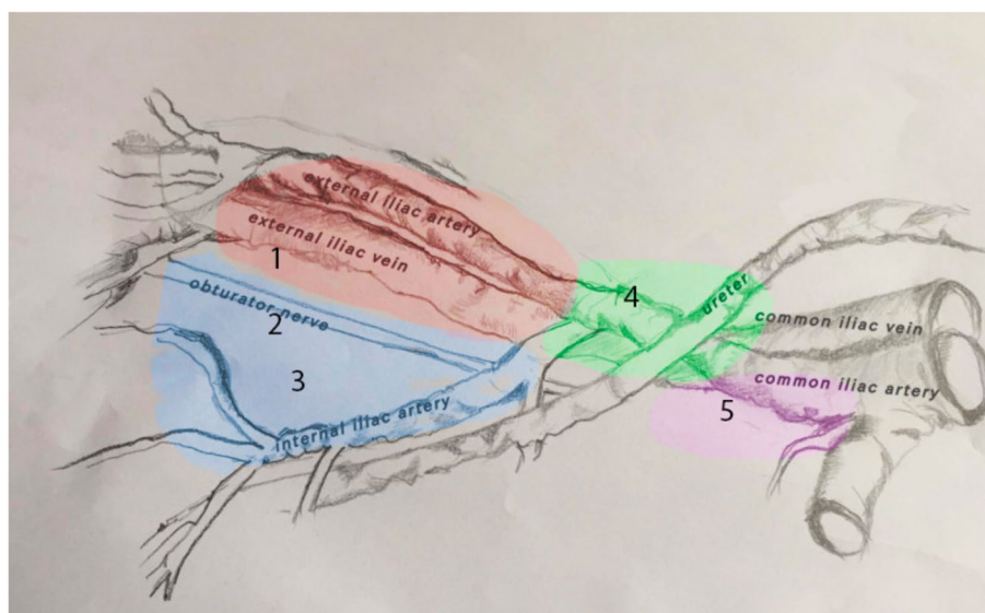
Fig. 1 Anatomic limits of pelvic lymph node dissection (PLND). Area 1 (red): limited PLND. Areas 1–3 (blue): standard PLND. Areas 1–4 (green): extended PLND. Areas 1–5 (purple): superextended PLND