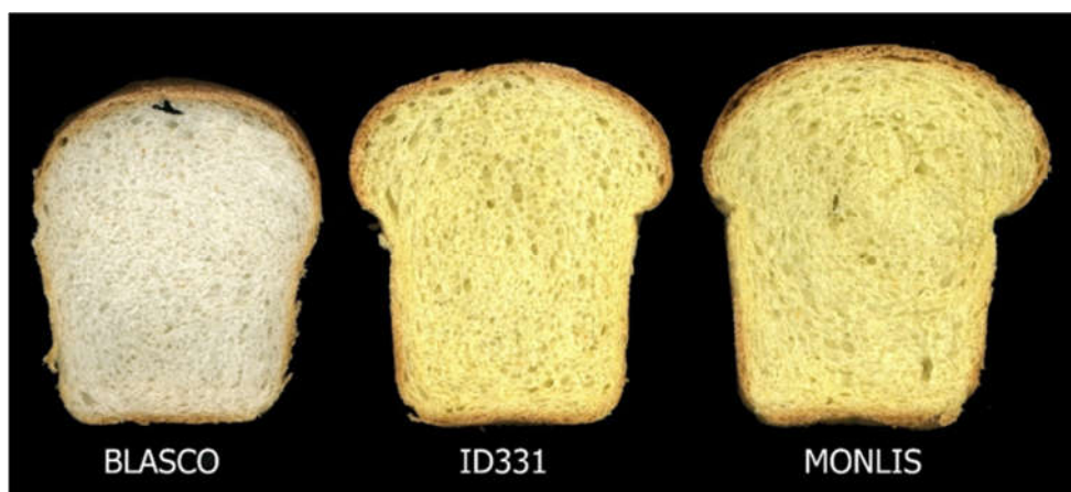
Figure 1. Bread slices prepared from flours of bread wheat Blasco, einkorn ID331, and einkorn Monlis.

it was 57.8 g/100 g for Blasco. Probably during milling the harder bread wheat kernels broke into larger fragments, thus originating, in comparison to einkorn, a coarser flour. No major differences between ID331 and Monlis were observed.