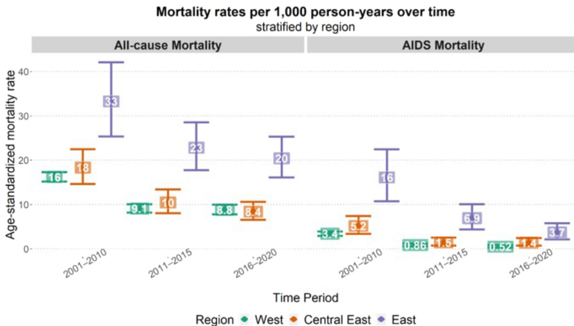
Fig. 2: Age-standardized mortality rates (all-cause and AIDS mortality) per 1000 PYFU, stratified by region and time-period under follow-up.