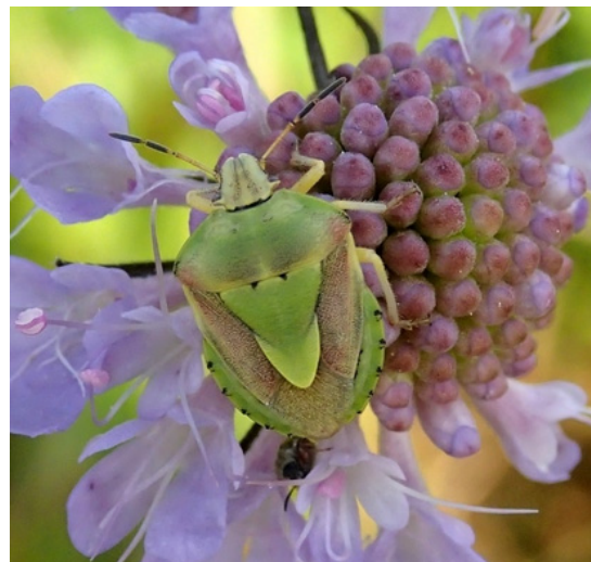
Figure 7. Antheminia lunulata (Goeze 1778).

The lowest number of species (10) was collected in the Miscanthus crop (Station 4). The species were ubiquitous and also found in the reserve, except for the uncommon Lygus italicus (Wagner, 1950). This last species is a Mediterranean one, scattered along the peninsula and the two main islands on Salicornia fruticosa (L.) L. (Chenopodiaceae), Inula sp. (Asteraceae), Artemisia vulgaris L. (Asteraceae), and Xanthium spinosum L. (Asteraceae) rare in the Northern region, and a new record for Lombardy, it gradually increases southwards [10]. Its presence was scarce and occasional in the crop. This species probably came from the reserve, as common Lygus pests, such as L. pratensis and L. rugulipennis , were absent in the crop.