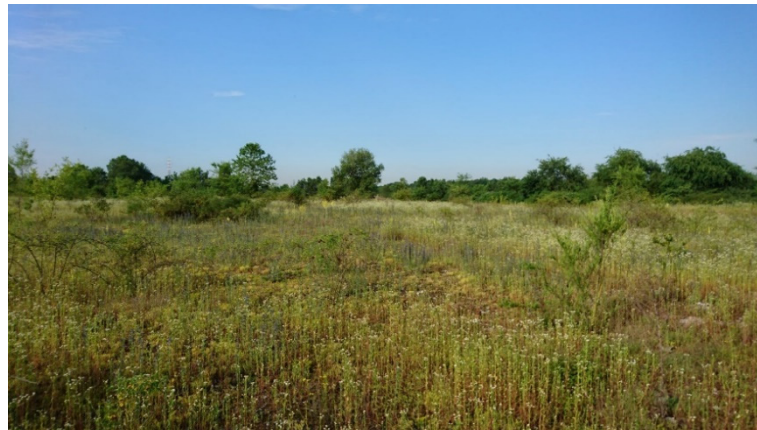
Figure 4. Malpaga-Basella Nature Reserve, station 3, with the largest number of plant species, a higher number of shrubs and invasive species.

Station 4 (Figure 5) was in the Miscanthus x giganteus (Poaceae) crop, separated from the dry grassland by a wood with temporary ponds. The crop has been cultivated since 2012.