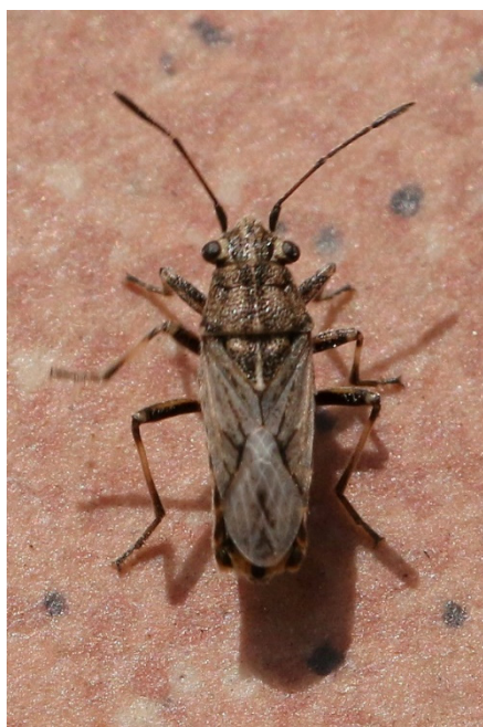
Figure 8. Ortholomus punctipennis (Herrich-Schäffer 1838).

Another species typical of dry areas are the Nabidae Prostemma ( Prostemma ) guttula , a Mediterranean species recorded throughout Italy in dry, rocky or sandy soil under stones during the day. It preys on Lygaeidae (s.l.) and Pentatomidae [3] and overwinters as an adult; among Coreidae, Ceraleptus obtusus and Arenocoris waltlii (Figure 8), a Mediterranean species, widespread in Italy and a new record for Lombardy. The preferred host plants are Erodium cicutarium (Geraniaceae), Sarothamnus scoparius , Trifolium , Calluna vulgaris (Ericaceae) and Thymus serpyllum . Adults are recorded from March to August [5].