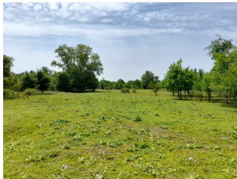
Figure 3. Malpaga-Basella Nature Reserve, station 2, with the predominance of Poaceae.

Station 2 (Figure 3) was on a terrace close to the river, bordered by a forest, mainly composed of elms and elders, crossed by the excess water of the temporary ponds that flow into the river. Compared to the first station, the soil was slightly richer in humus; there was a greater presence of Poaceae, Ulmus spp. (Ulmaceae), and A. fruticosa .