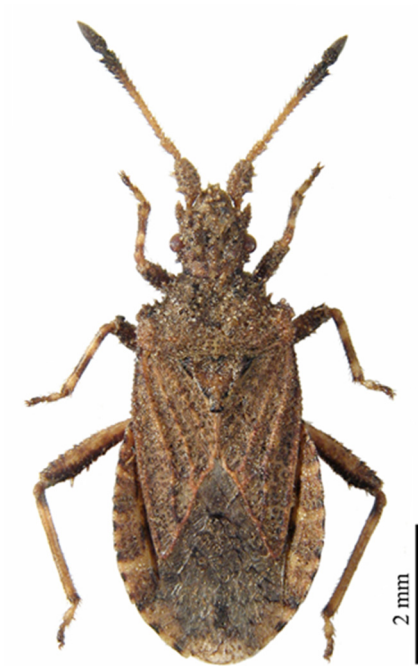
Figure 6. Arenocoris walthii (Herrich-Schäffer 1834).