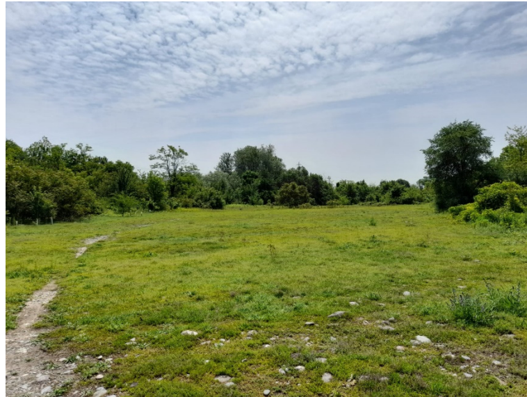
Figure 2. Malpaga-Basella Nature Reserve, station 1, characterized by high stone content and low plant cover.

species that compromise the biodiversity of the area [9]. Among the three dry grassland stations, this presented the highest stone content, and lack of water, few shrubs of R. canina and Rubus spp., and the soil had the lowest plant cover.