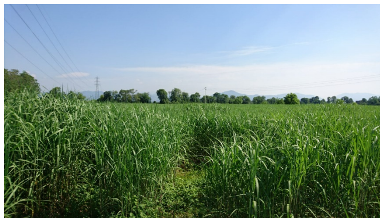
Figure 5. Miscanthus x giganteus crop, station 4.

Station 4 (Figure 5) was in the Miscanthus x giganteus (Poaceae) crop, separated from the dry grassland by a wood with temporary ponds. The crop has been cultivated since 2012.