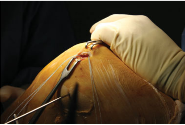
Fig. 1 Preparation of the osseous surface on the medial side of the patella.