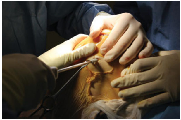
Fig. 3 Fixation of the graft on the femoral side using a biodegradable interference screw.