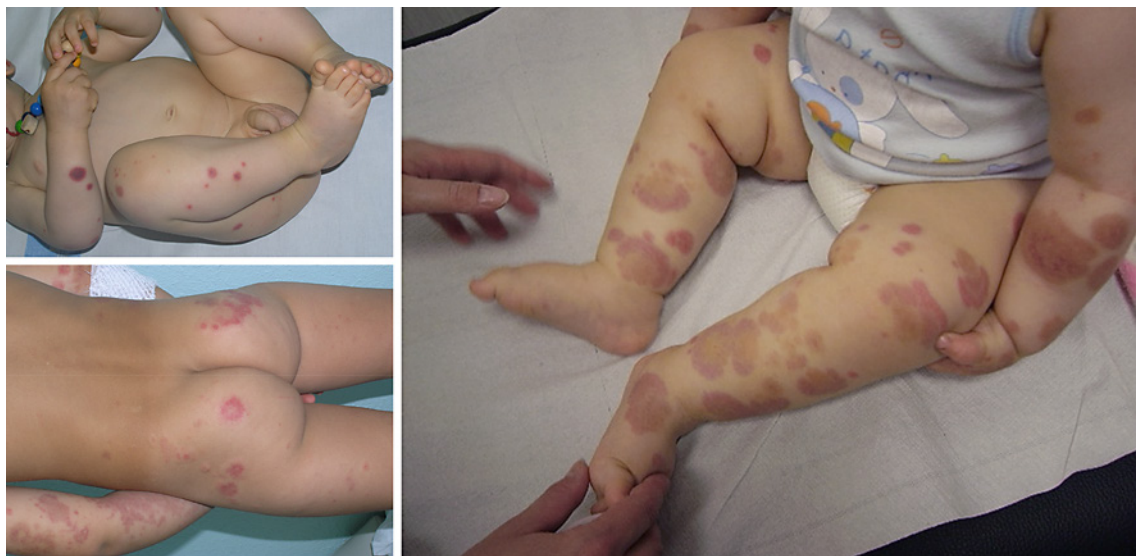
Fig. 1. Nummular and annular skin eruptions in three boys affected by acute hemorrhagic edema of young children.

A predesigned form was employed to record information about demographics of cases, and type, distribution, or evolution of eruptions. Two authors independently extracted the data in a non-blinded fashion. Uncertainties were resolved through team discussions and consensus.