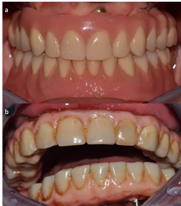
Figure 3. Clinical appearance after 3 months. The onset of chlorhexidine-related stains is evident. (a) Experimental group; (b) control group.

Both groups show an improvement in the two analyzed periodontal indices. Regarding the bleeding index (mBI), in the test group, there was an improvement ranging from a minimum of 42% in a patient to a maximum of 100% in three patients with single crowns. The control group had a minimum percentage of 36% and a maximum of 88%. The plaque index improved in both groups, with a minimum reduction of 0% to a maximum of 100% in a patient for the test group. The control group demonstrated a minimum percentage of 43% and a maximum of 100% in a patient. The average rate of improvement for the values of mBI and PI of the two groups at the end of experimental treatment was also calculated.