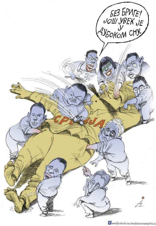
Figure 3. “Serbia is sleeping” (NIN, 20/7/2017). (Quote: “Don’t worry! He is still deep asleep.”)

In the cartoon “Serbia is sleeping” (Figure 3), the visual metaphor of a sleeping man is used to portray the state of the nation under Vučić’s rule. “A state is a person” metaphor (Lakoff, 1993: 243) is common in political cartoons, especially in those reflecting foreign policy concepts. However, in this cartoon, the ‘sleeping body of a nation’ metaphor is used to underline the country’s inability, incompetence and lack of interest in standing against the violence of the regime. This cartoon depicts various criminal and violent actions by holders of some of the most dignified offices at state-level, such as president, foreign minister, parliament speaker, ministers of the government and MPs, together with a pro-government tabloid’s owner.