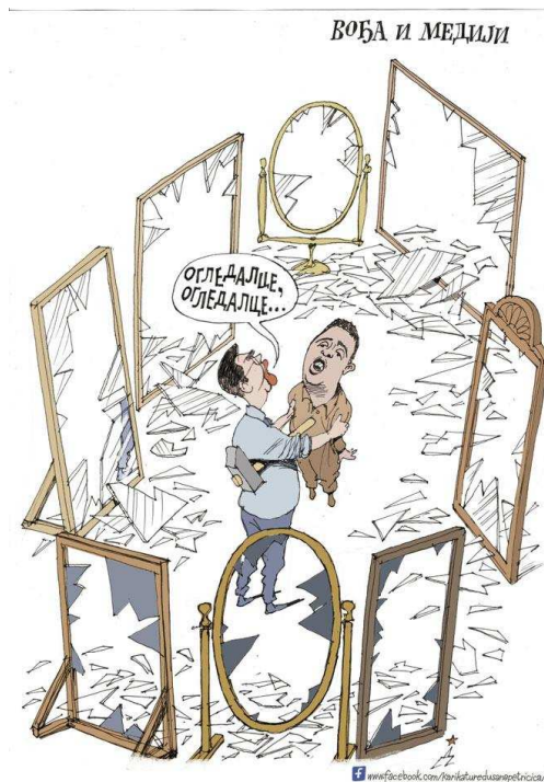
Figure 4. “The leader and media” (NIN, 28/9/2017) (Quote: “Magic mirror in my hand, magic mirror in my hand...”)

“The leader and the media” (Figure 4) exposes the destructive relationship of the regime with obedient media. The cartoon represents a combination of Morris’s functions of domestication and opposition. Pro-government media serving as an instrument of the regime have been domesticated with the face of Dragan Vučićević, the owner of the tabloid Informer , well known among all sections of the population for his close relations with Vučić and his readiness to defend Vučić at all costs against potential criticism. At the same time, the binary opposition of adult (Vučić) – child (Vučićević) in this cartoon does not have the intention to discount the value of the latter, but to indicate dependency and obedience to the adult. At the same time, it glorifies the power of Vučić who has been publically depicted as a ‘founding father’ and one of the main supporters of the tabloid Informer .