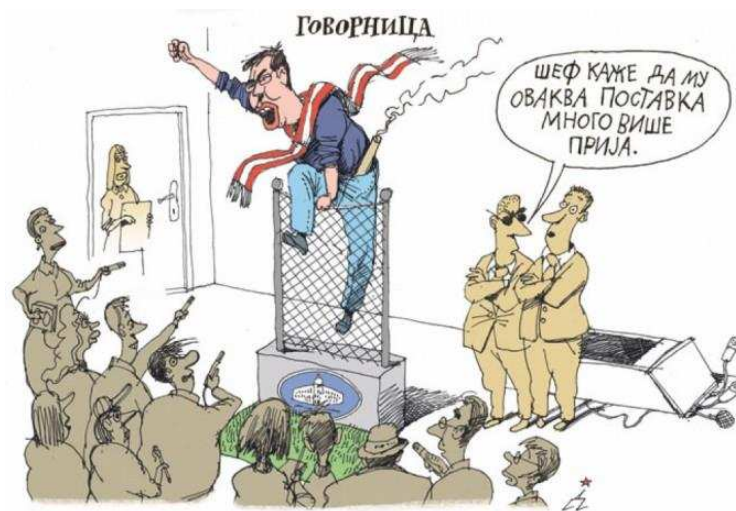
Figure 2. "The pulpit" (Politika, 17/7/2016). (Quote: "The boss says he prefers this setting.")

alarming rise of corruption in society. The victims of such destructive leadership in the cartoons are ordinary people, together with political, educational and cultural institutions and Serbia as a whole. In some cartoons Petričić goes even further and addresses the theme of violence by portraying the prime minister as a perpetrator of violence, for example as a football hooligan. In that way the cartoonist's intention is to expose Vučić's personal violent background and its consequences on the nature of his governance.