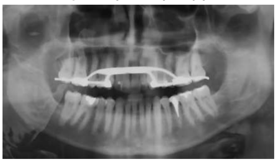
Figure 2. Pre-operative orthopantomograph.