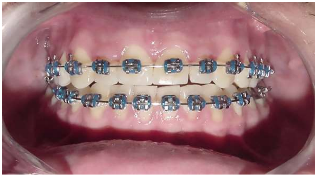
Figure 7. Clinical result at the end of the orthodontic treatment.