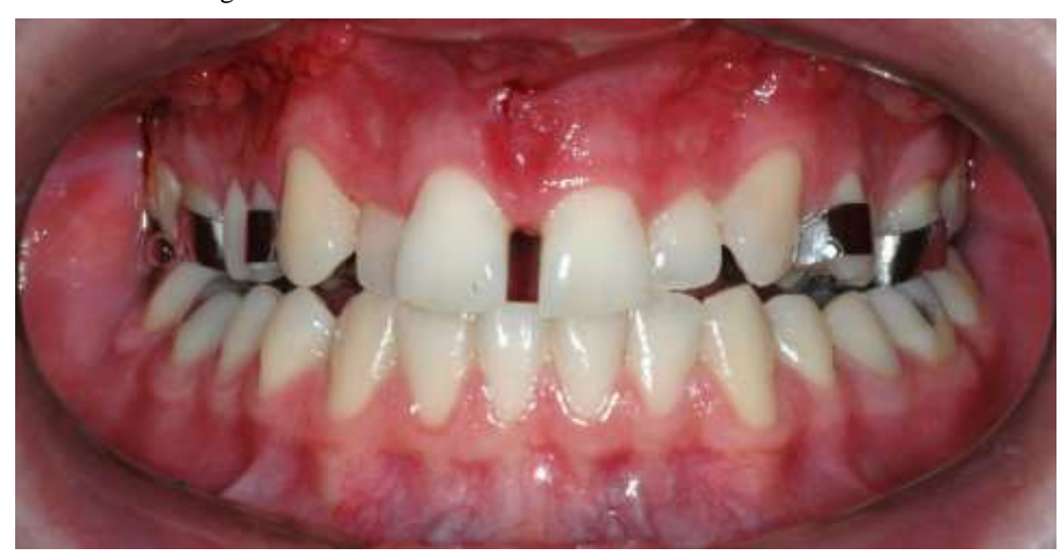
Figure 5. Clinical view 14 days after the surgery. It is possible to observe the interincisor diastema after 7 days from the beginning of the treatment. A transverse gain of 3.5 mm has been obtained.