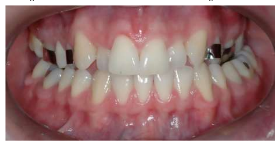
Figure 1. Frontal view of the clinical situation before starting the treatment.

A 27-year-old Caucasian man, presented to the authors, referred by the orthodontist to have SARME performed. Careful anamnesis was collected and routine laboratory exams requested, in which it was found that the patient presented ASA Grade I surgical risk. During clinical evaluation, transverse deficiency of the maxilla with posterior cross bite was observed (Figure 1). Radiographically, root divergence was observed of teeth 11 and 21, with sufficient space for median osteotomy (Figure 2).