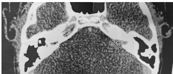
Fig. 1 Axial contrast CT images. A contrast-enhancing mass is clear in the left CPA and IAC