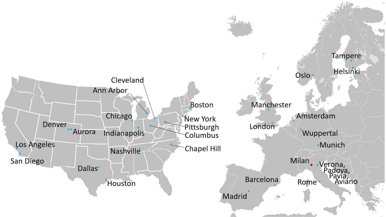
Supplementary Figure 2. Geographical distribution of participating centers. Red, site of the coordinating center. Blue, sites of the participating centers.