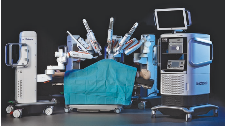
Fig. 25.2 Hugo robotic-assisted surgery system.