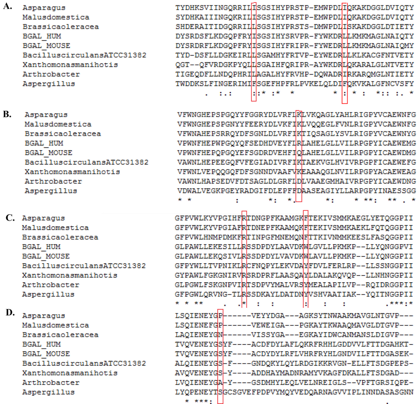
Figure 1. GLB1 sequence alignments between species

Family 35 glycosyl hydrolases and related proteins were aligned in the regions surrounding the new amino acid changes (p.I51N, p.L69P, p.R109W, p.R148H, p.W161G, and p.S191N) identified in GM1 gangliosidosis patients. Both aligned amino acids are indicated by squares. * Total sequence homology; : Very high homology; . High homology. A. p.I51 and p.L69 amino acids; B. p.R109 amino acid; C. p.R148 and p.W161 amino acids; D. p.S191 amino acid.