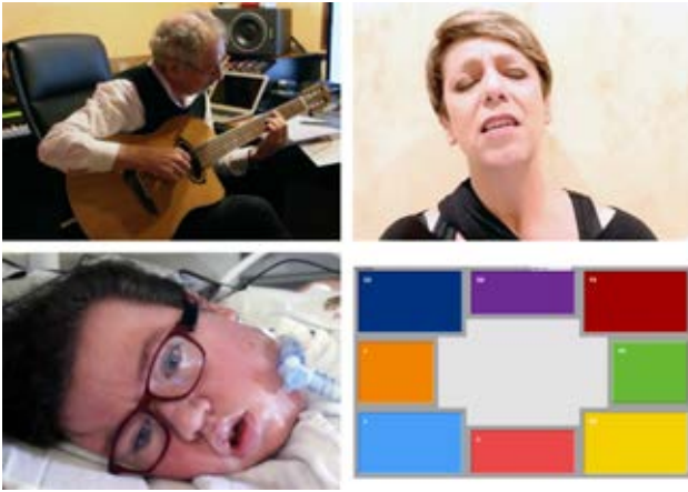
Figure 1. An ensemble music session involving a musician with impairment using a crafted version of Inclusive MIDI Controller , a guitarist, and a singer.

work by Pedrini et al. [25], which addresses the problem of evaluating the accessibility of digital audio workstations for blind or visually impaired people. The paper also contains the results achieved with three popular DAWs, namely Cockos REAPER , Avid Pro Tools , and Steinberg Cubase .