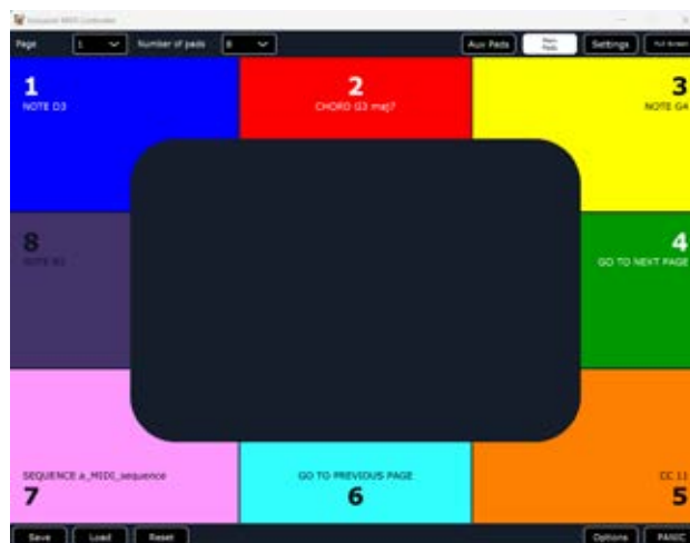
Figure 4. Layout of the Inclusive MIDI Controller interface.