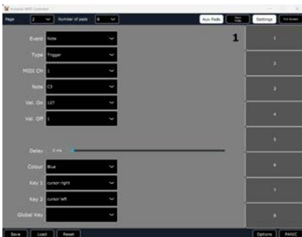
Figure 3. The interface to configure settings.

The Aux Pads menu presents further buttons, identical in appearance and configuration to the colored ones, but visible only through this specific menu. They can be activated via keyboard shortcuts only. The screen to set the parameters listed above is shown in Figure 3. The interface allows the user to save each setting locally, load it later, and reset each pad. The latest configuration is saved for future sessions.