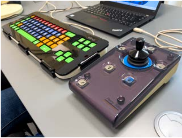
Figure 5. Participant 1’s expanded keyboard with key-guard and mouse with joystick.

The basis of this question is the perspective that led to the design and implementation of Inclusive MIDI Controller as an accessible tool to include the largest part of individuals, overcoming their possible physical, cognitive, or social impediments.