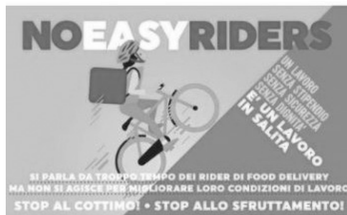
FIG. 2. No Easy Riders flyer.