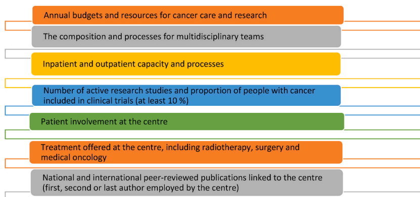
Fig. 1. List of factors that need to be taken into account in cancer centers [3].

NGS methods have emerged as versatile tools for genomics and clinical activities involving DNA analysis. NGS is a high-throughput technology that aids in integrating molecular tumour profiles into precision oncology decision-making. Diagnostic centres increasingly