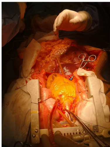
Figure 3 Abdominal normothermic regional perfusion. To establish abdominal normothermic regional perfusion, the aorta and the inferior vena cava are cannulated via femoral vessels. A balloon catheter is inserted in the aorta and inflated above the coeliac trunk in order to exclude the thoracic circulation. This procedure allows for abdominal organ preservation and assessment. The symbol identifies the clamp on the inferior vena cava as described in our protocol (17).

vasodilators. A generous retrograde flush from pulmonary veins is an important step in the management of grafts from DCD (9).