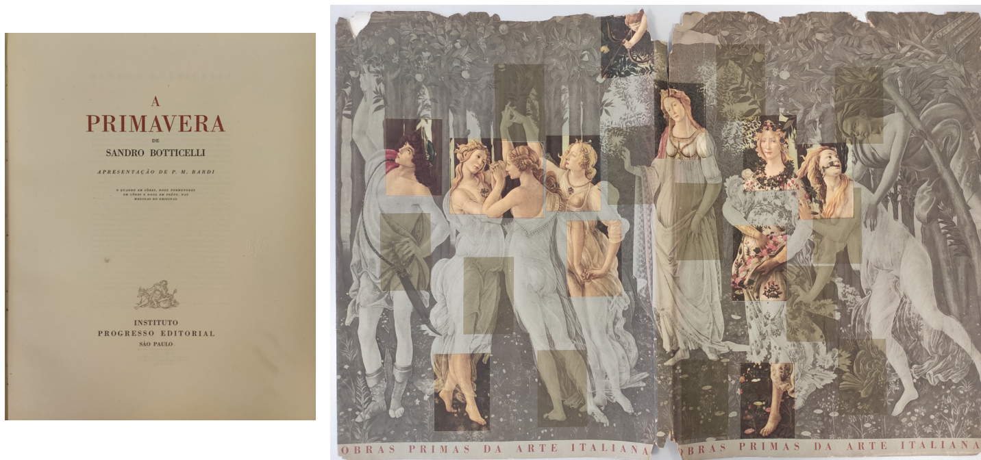
FIGS.5-6. The Primavera Brazilian edition: A Primavera de Sandro Botticelli, “Apologia das obras-primas da arte italiana reproduzidas no tamanho original” series. São Paulo; Milan: Instituto Progresso Editorial; Bompiani, 1947, frontispiece and dust jacket.