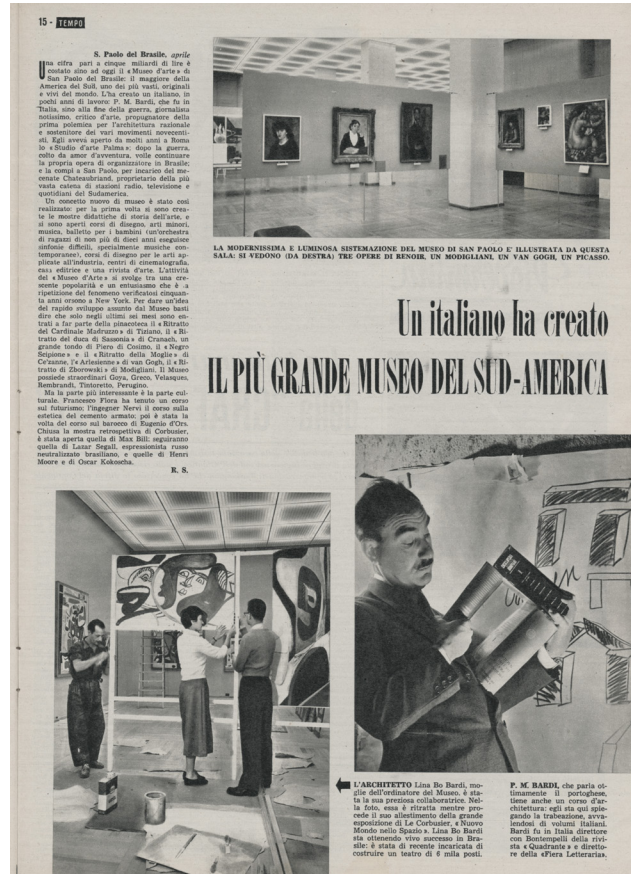
FIGS.1-2. O Cruzeiro, September 1947; Tempo, April 1951.

The figure of Bompiani played in fact a not secondary role in these events and accompanied Bardi since his arrival to Brazil as entrepreneur and cultural mediator. In 1951, the Italian illustrated magazine Tempo published the article “Un italiano ha creato il più grande museo del Sudamerica” (R.S., 1951). At that date the Italian Bardi was the ascending director of the MASP, which had recently inaugurated its renewed headquarters in the Diários Associados building 10 . In the picture portraying him we can distinctly see a Bompiani volume, the first tome of the Enciclopedia pratica (1938), used like