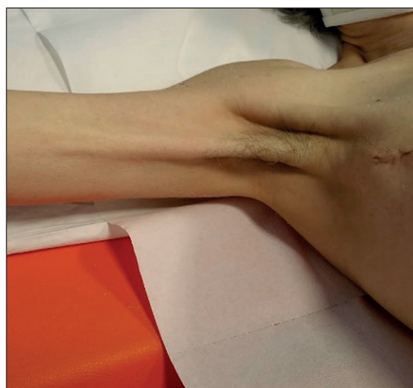
Figure 1. Example of breast cancer women with axillary web syndrome.

1. BC characteristics: (a) TNM classification; (b)