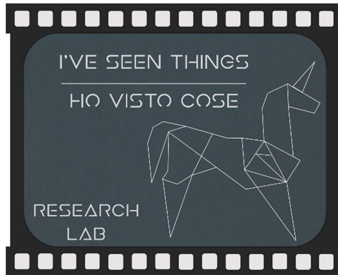
Fig. 2. Logo of the I've Seen Things Lab

performed under constant supervision of qualified personnel. Current state of the art in digital restoration is mainly based on color grading techniques: "primary" grading affects the levels of RGB, gamma, shadows and highlights in the entire frame, while "secondary" techniques apply changes only on a selected range of colors or windows in the frame.