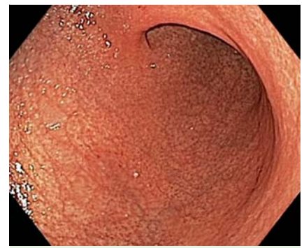
Fig. 1 High-definition white-light endoscopy showing extensive absence of gastric rugae and visible vessels upon the gastric mucosa, consistent with macroscopic signs of atrophic gastritis.