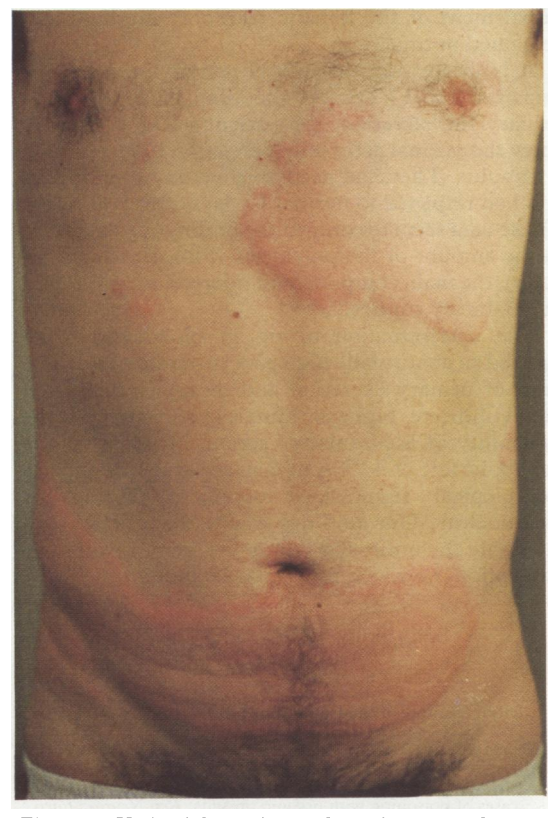
Figure 1 Urticarial eruption on the patient exposed to triphenyltin acetate.

value 60–110), \gamma -glutamyl transpeptidase ( \gamma -GT) 68 IU/l, and bilirubin 1.52 mg/100 ml (normal value 0.36). Other routine laboratory findings were normal. A glucose tolerance test on the fifth day showed impairment of glucose metabolism and slight glycosuria.