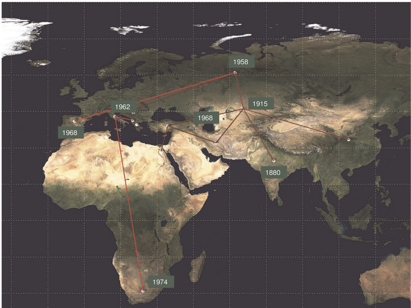
Figure 2. Significant non-zero HBV-D migration rates worldwide. Only the rates supported by a BF of >6 are shown. The relative strength of the support is indicated by the colour of the lines (from dark red=weak to light red=strong). The map was reconstructed using SPREAD (see Methods).