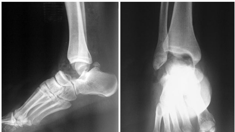
Fig. 1 X-ray shows the absence of talus without any fracture of the surrounding bones

Mobilization of the ankle without weight bearing was allowed after removal of the external fixator. Literature is rather unforthcoming in suggesting guidelines due to the rarity of missing talus lesions. We opted to precociously allow careful movements without weight bearing in order to avoid atrophy and to restore talus and surrounding tissues. Weight bearing was then gradually introduced at 3–4 months after the final surgery, and after 6 months, full weight bearing was achieved. At the 4-year follow-up, the joint showed no signs of avascular necrosis, neither plantarflexion nor dorsiflexion showed impairment, and ambulation was regular (Fig. 5).