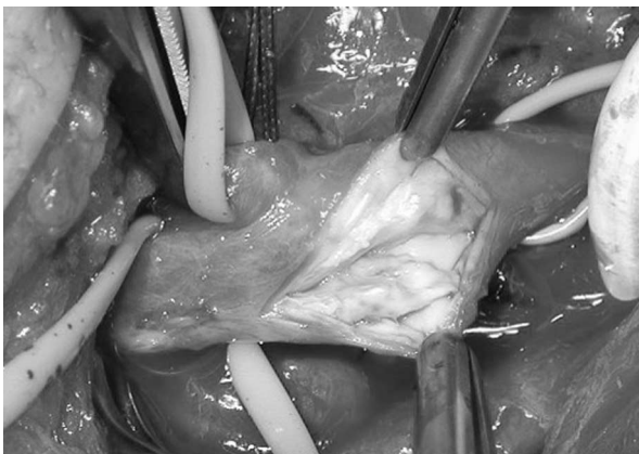
Fig. 1. Fibrous-calcific atheromatous plaque during endarterectomy.

In June 2000, the patient suffered new episodes of paresthesia of the left hand as well as amaurosis fugax in the left eye. A brain computed tomography scan showed an ischaemic lesion in the right occipito-parietal region. The Doppler sonography led us to suspect severe stenosis in the right common carotid artery. A computed tomography angiography con-