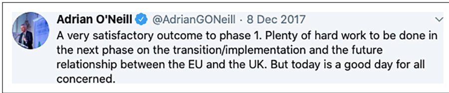
Figure 3. Example of a Brexit tweet with expressed opinion and positive evaluation. Tweet by Ireland's Ambassador to the UK, Adrian O'Neill.