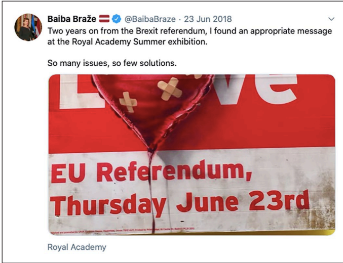
Figure 2. Example of a Brexit tweet with expressed opinion and negative evaluation. Tweet by Ambassador of Latvia to the UK, Baiba Braže.