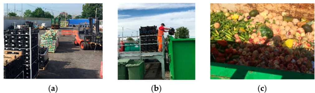
Figure 1. The collection site of fruit and vegetable waste in the General Wholesale Market: crates of vegetables discarded (a), manually dropped in the containers (b), and a representative mix of fruit and vegetable waste discarded in the containers (c).

In this study, the fruit and vegetable waste from the General Wholesale Market (SO.GE.MI. S.p.a.) of the city of Milan, the largest in Italy, was considered, where fruits and vegetables are sold to retailers. Every day the unsold products that have lost their commercial value (perishable products in a wholesale market are not suitable for sale the following days because freshness cannot be guaranteed) but still perfectly edible, are collected and redistributed to charitable organisations that assist poor and needy people (about 1500 tonnes/year). On the other hand, unsold products damaged with spoils and bruises become waste (about 1700 tonnes/year) and are discarded at the waste-collecting site and dropped in containers, as showed in Figure 1.