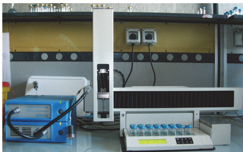
Fig. 1. An example of electronic nose.