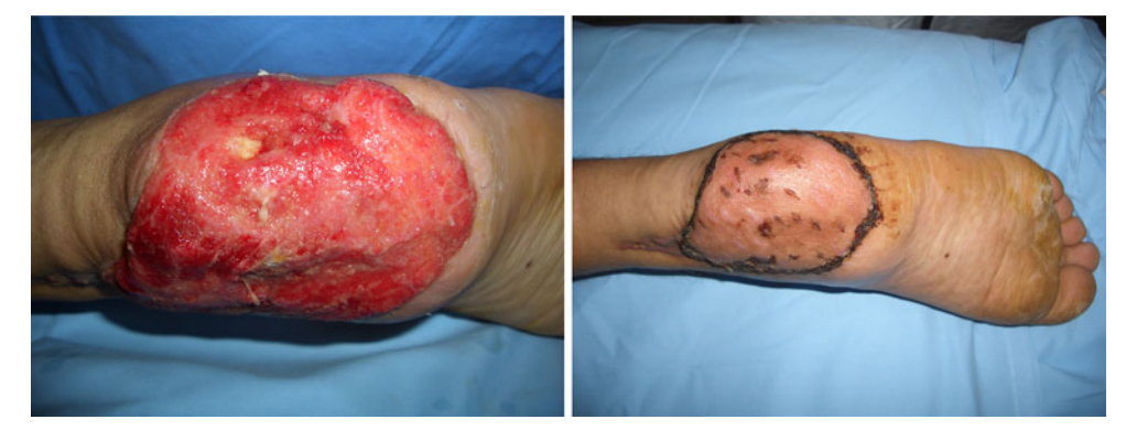
Fig. 4 After NPWT removal, the wound showed viable granulation tissue, and a partial-thickness skin graft was employed for wound treatment; complete healing occurred 8 days after NPWT removal

Lee et al. [10] demonstrated in an animal model the active role of leeches in minimizing flap necrosis after venous congestion. In this case the data concerning the success rate of leech therapy are not clear. NPWT has