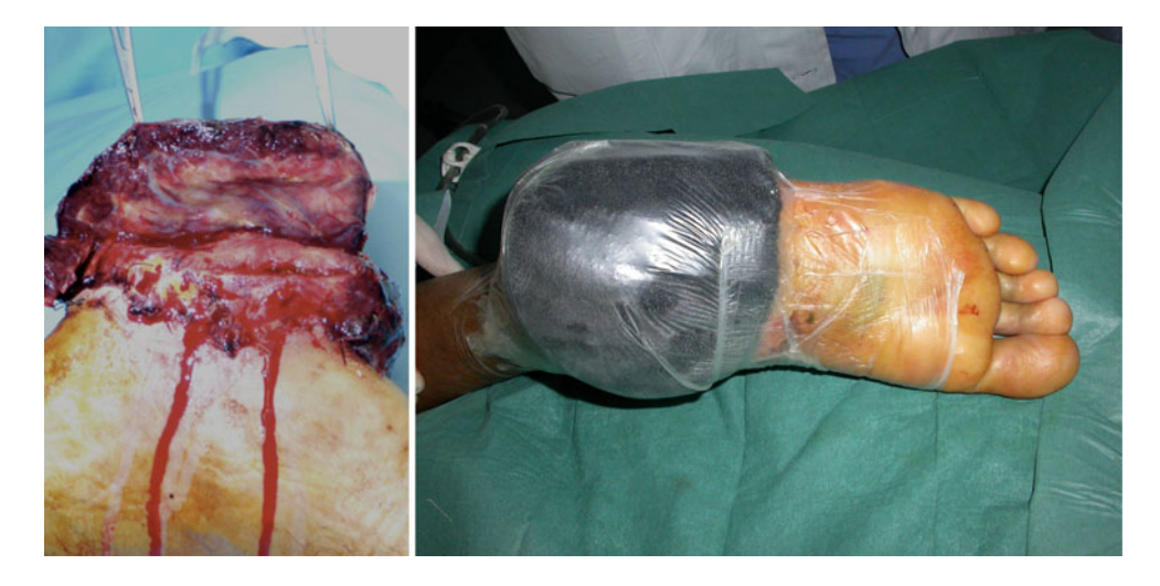
Fig. 3 Twenty-five days postoperatively partial debridement of the flap was performed, and NPWT was applied for 2 weeks