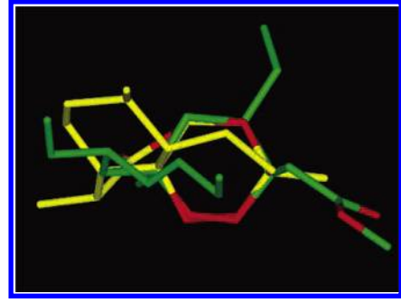
Figure 4. Superimposition of the lowest energy conformer of plakortin (1) on artemisinin X-ray structure (CSDS code: QNGHSU). Carbons are in green for plakortin (1) and in yellow for artemisinin; oxygens are in red. All hydrogens are omitted for clarity.

General Methods. Optical rotations (CHCl<sub>3</sub>) have been measured on a Perkin-Elmer 192 polarimeter equipped with a sodium lamp ( \lambda = 589 nm) and a 10-cm microcell. Low-resolution ESIMS