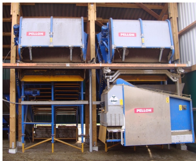
Fig. 3: Rail-guided feeding system with dispensers (Pellon)

An exact description of the systems was given in ART Report 710 (Nydegger & Grothmann, 2009).