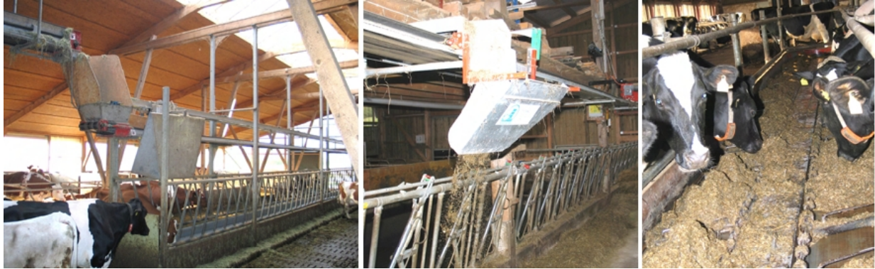
Fig. 2: Conveyor belts can distribute individual feed components or mixtures. They are either mounted above head height (left and centre) or in the feeder (right), and in new buildings can be built in straight away (left and centre) or retrofitted.

Automatic mobile feeding systems include self-propelled feeders. Cormall's Robot Multi Feeder is fully automatic. The robot is controlled by a sensor and an induction wire let 2-3 cm into the floor. The dispensing wagon can be filled automatically from one or more stationary mixing vessels by doctor rolls and can eject the feed either to the right or left. The Multi Feeder is driven by a diesel engine.